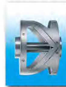
STAINLESS SLIT DRUM