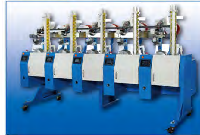
5 SPINDLES FOR A-CONE AND Y-CONE