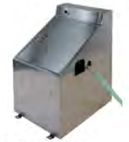
AUTO CIRCULATING LUBRICANT TANK (OPTIONAL)