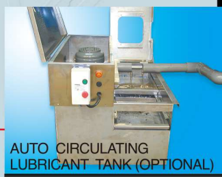
AUTO CIRCULATING LUBRICANT TANK (OPTIONAL)